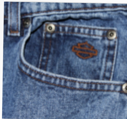
H-D FASHION SHOW