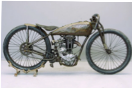
Harley Davidson 1917

the BIGGEST and the BADDEST Texas has to offer!