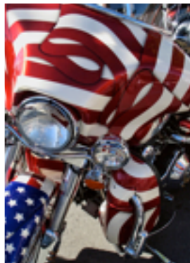
Stars & Stripes